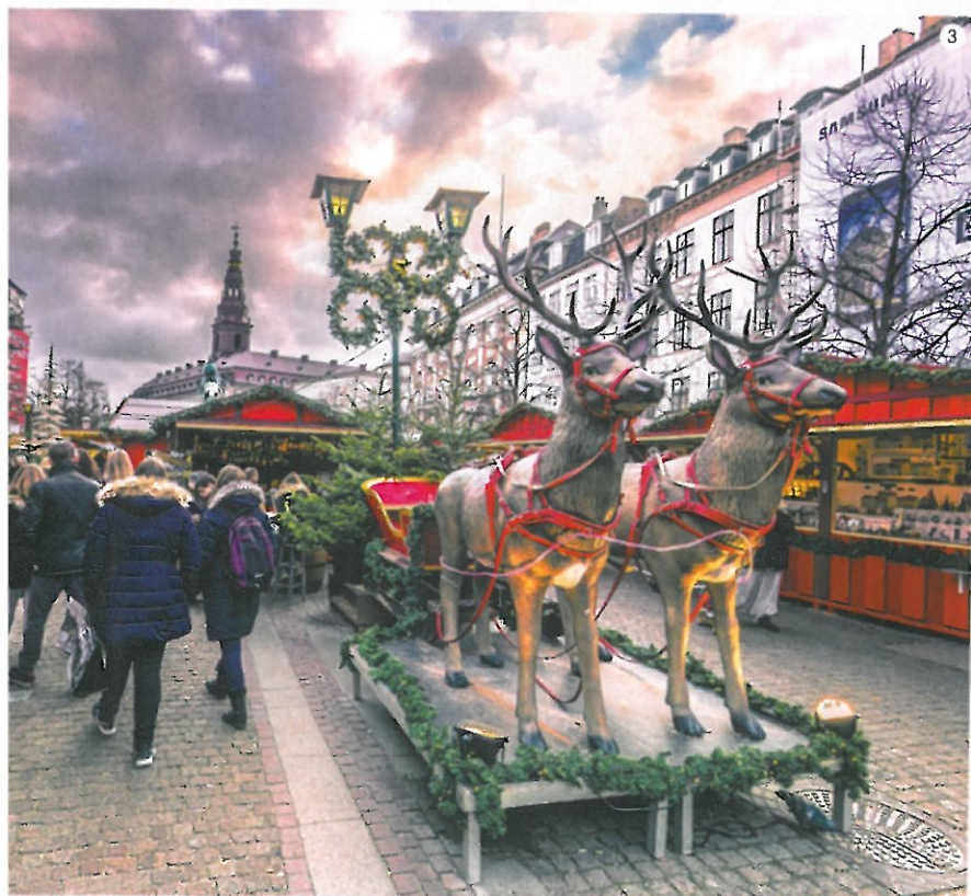
3. Festive decorations at the Christmas market in central Copenhagen