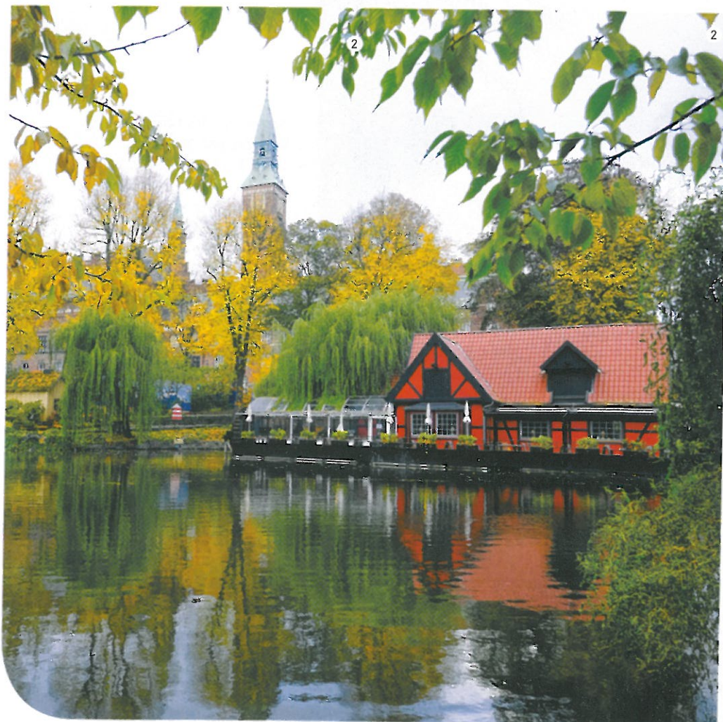
2. The city in autumn

yellow, October 14 ushers in a nine-day public autumn break. Till October 22, many of Copenhagen's attractions, museums and institutions offer special activities tailored for families and children in particular. This is also a great time to soak in Danish culture, as the annual Culture Night kicks off the holidays with hundreds of cultural events in a single night! It lets you experience Denmark's beautiful capital in a new light, opening up places not otherwise accessible to the public.