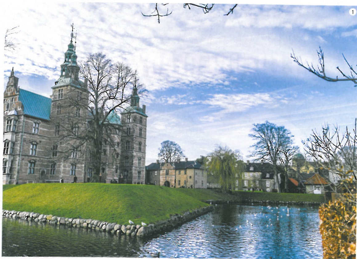
1. The Rosenborg Castle