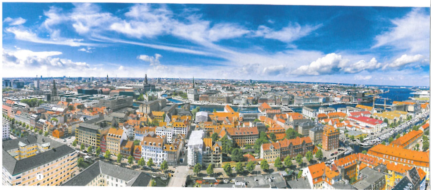
1. A panoramic view of Copenhagen